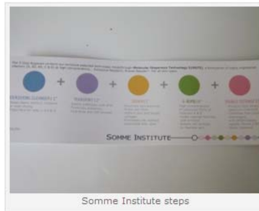
Somme Institute steps