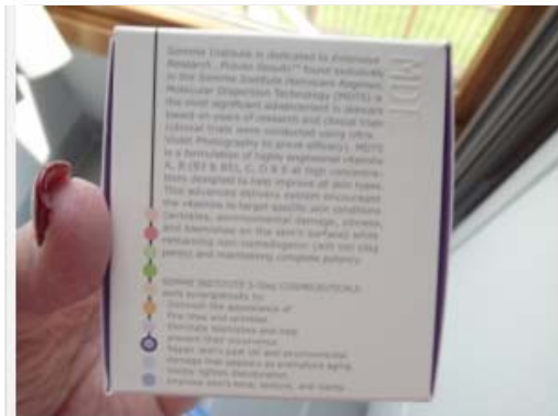
Somme Institute Transport box

Step 2 TRANSPORT : There are 50 pads in this jar that are toning and exfoliating pads. I use this just once a day although I did start out at twice a day. The pads are generously soaked with the ingredients. This removes dead skin cells while unlogging pores (aka Mt. V). It improves resiliency and gets the skin ready to receive the other treatments.