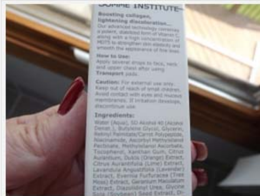
Somme Institute Serum box

Step 3 SERUM : This serum is a vitamin C serum that was created by Somme and maintains a high concentration of the C benefits without oxidizing or losing its potency. Two drops is enough for my entire face, neck and décolleté.