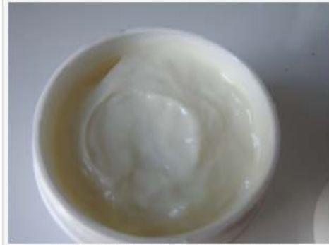
Somme Institute interior of A Bomb

Step 4 A-BOMB : As you can tell by the name this is a product containing vitamin A plus vitamin E. This is considered to be a Vitamin Infused Moisturizer and can be used independently but the real beauty is when you use this in conjunction with the Serum and program since they work together synergistically. This is a fluffy moisturizer that my skin just drinks up.