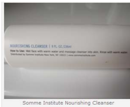
Somme Institute Nourishing Cleanser

Like I said there are 5 steps to the Somme Institute program. They are to be done twice daily but you can modify it as needed. As much as I'd love to go into a ton of detail, I don't want to lose you so here's a brief description of the 5 products.