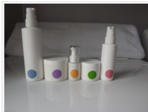
Somme Institute 5 steps

I've been very quiet on the skincare front lately but that's about to change. I've spent the last 2 months using the most wonderful skincare system and now it's time to share. As a beauty blogger I get the chance to try out a lot of products and I always want to give them a fair shake before reporting to you; a month is the typical amount of time before I report on something. I'm currently using a 5 step program from Somme Institute and it's been 2 months of pure pleasure. I knew very quickly that this was a skincare system that was working for me but a few things happened that made me realize what a fabulous brand this is.